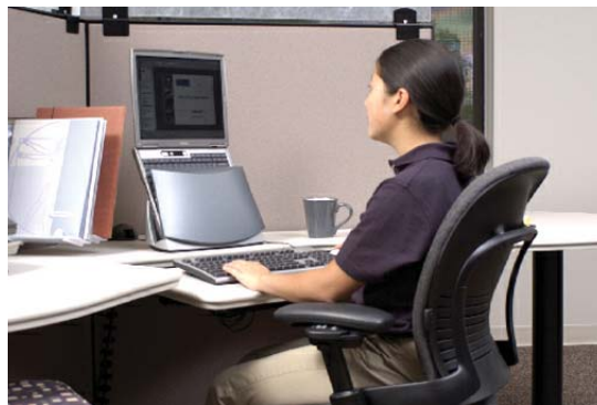
Leap fits Humantech personnel of all sizes.